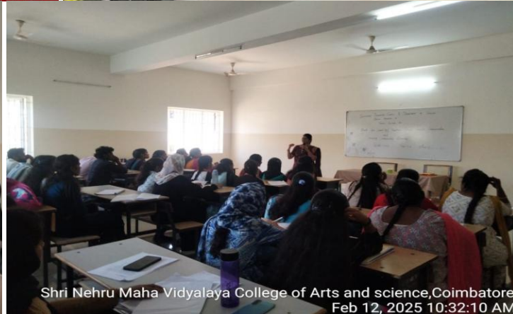
Shri Nehru Maha Vidyalaya College of Arts and science,Coimbatore Feb 12, 2025 10:32:10 AM